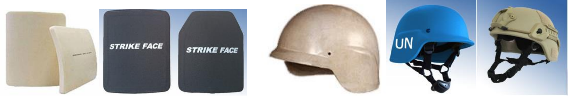
Ballistic Plate Ballistic Helmet