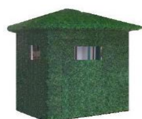
Ballistic Military Pavilion